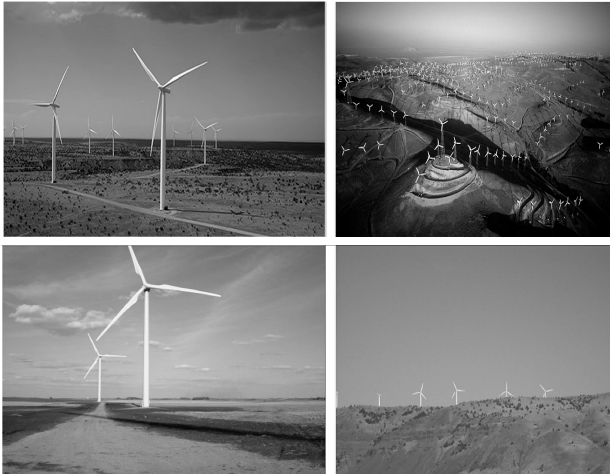
Figure 2. Photographic images of sites illustrating onshore landscapes where industrial wind turbines expose humans to minimal health risks due to large setback distances. Note that homes are not seen in the photos..

residential and other populations, especially vulnerable populations, that are or likely to be negatively affected.